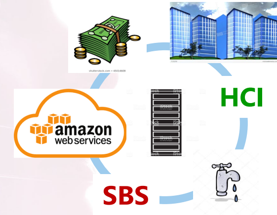
Proliferation of NVMe consumption models