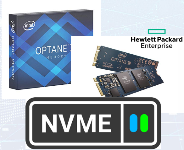
Persistent Memory and Storage-Class Memory